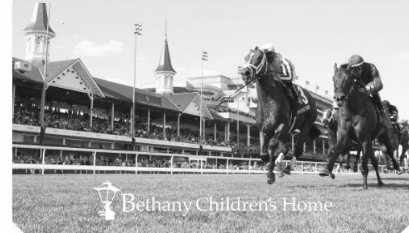
Bethany Children's Home

General Admission $75 • Gold Circle Admission $125