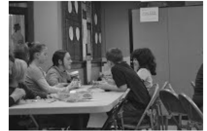
Children & Youth Ministries